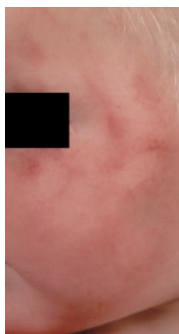
e.g. a slap mark

Imprints - Abusive bruises can carry the imprint of the implement used.